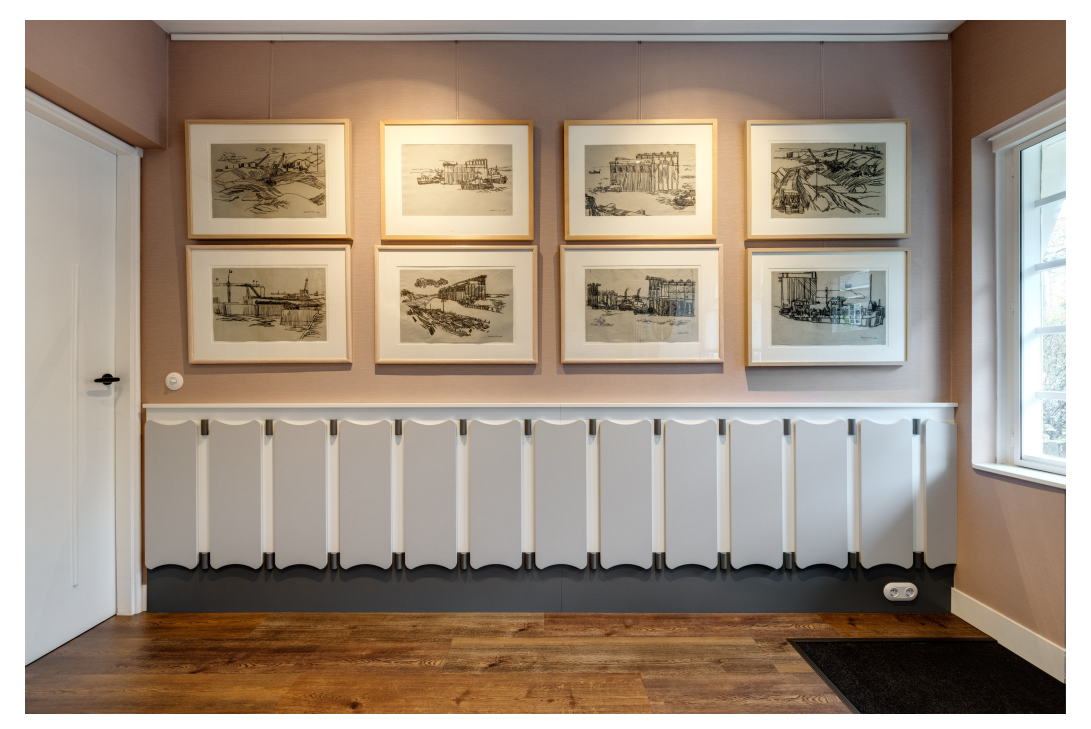
Jurrit van der Waal 064-DE JUUL-9130